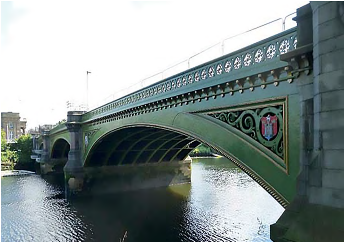
Albert Bridge Restoration completed by Ballantine Castings

Perfect for - lighter architectural castings especially where weight loading is important.