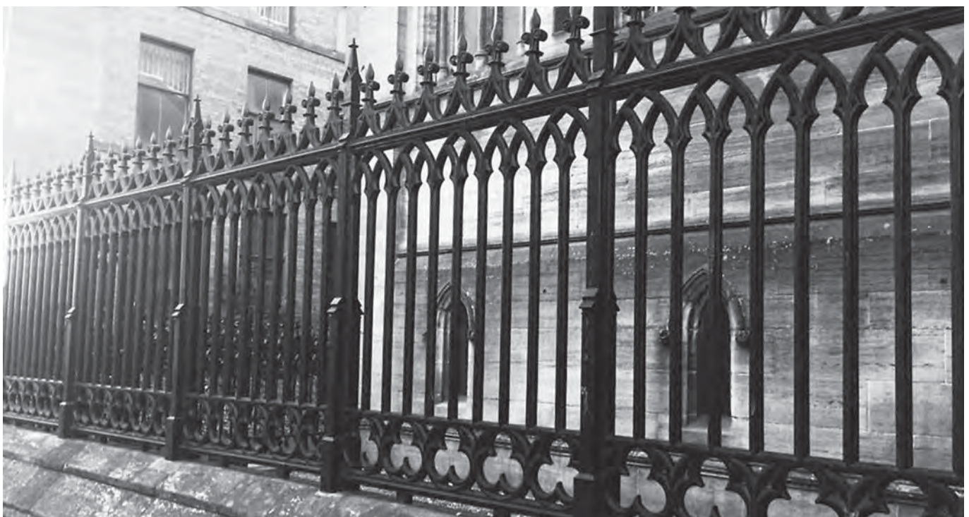
Ramshorn Theatre bespoke ductile iron railing panels and gates by Ballantine Castings