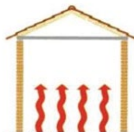
Underfloor Heating System