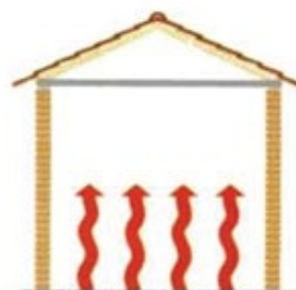
Underfloor Heating System